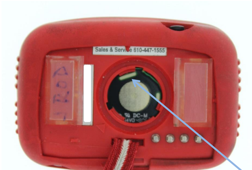
Location of Battery Clip

Resolution: The first remedy of course is to replace with fresh batteries, assuming this does not fix the problem, the issue is then most likely a bent battery clip. When customers are replacing batteries, there is a tendency to push the battery clip back against the support post. This is a thin metal sheet that sits in front of the support post in the 11 o'clock position. This is either creating an intermittent connection to the battery or no connection at all. Customers should gently nudge the battery clip towards the center of the battery chamber to ensure that proper contact is being made with the battery. Please see the accompanying figures for more details.